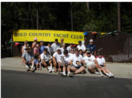
Catalina 22 "Go For The Gold" Participants