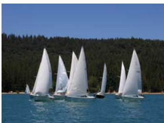
Catalina 22 Start