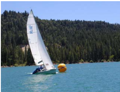
Ultimate 20 Stuart Wakeman Rounds a Mark

The race committee did a great job of varying courses and perfectly run races (good on ya' mates!). Five starts with 6 fleets (Centerboard "A" and Coronados raced together) made for good use of our Olympic Circle courses and the 5 minute starting sequences resulted in no General Recalls in the two day, five race event. Nicely done.