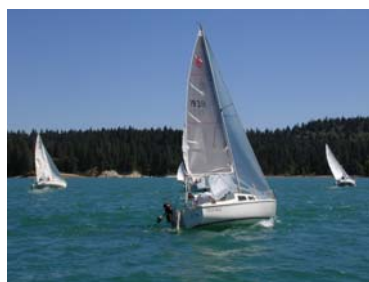
Great Club Racing