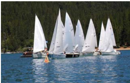
Catalina 22's On the Starting Line