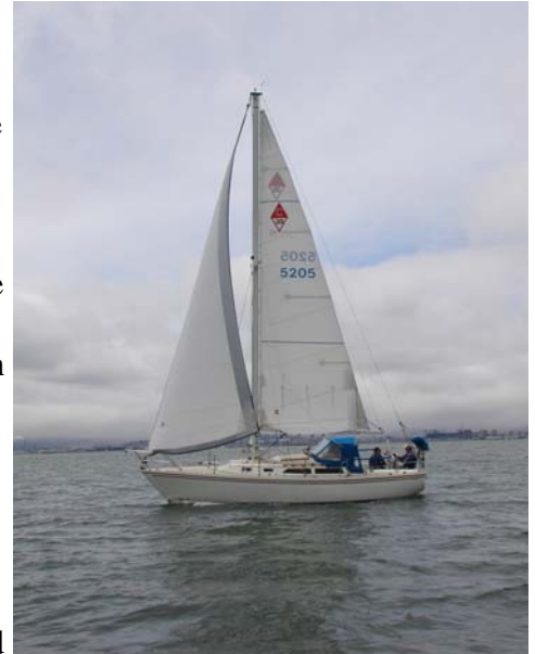
Hugh & Nicki Talman - Island Girl

Island Girl must have liked the trip because on the last week-