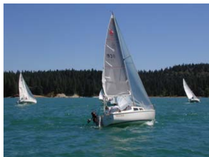
"Trouble" Story on Page 2