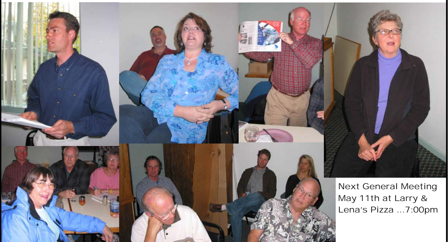
Next General Meeting May 11th at Larry & Lena's Pizza ...7:00pm

Can you Identify the New Members? How about the ones that thought this was a Board of Supervisors Meeting?